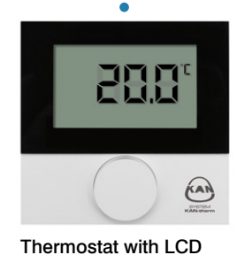
Standard - heating 230 V/24 V