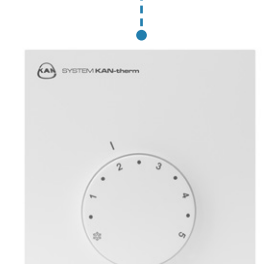
Analogue thermostat Heating 230 V/24 V