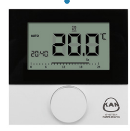
Thermostat with LCD